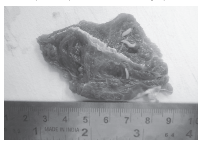
Fig. 4. Sarcocysts in meat

23.87% of the buffaloes examined at different cities of India showed grossly visible Sarcocysts indicating the severity of the problem associated with economic loss due to condemnations (Table 1). The prevalence was comparatively higher in oesophagus (26.89%) than meat samples (7.32%). This might be due to higher predilection of Sarcocysts in oesophagus and larger sample size (1,949 oesophagus samples) of oesophagus examined compared to meat samples. The prevalence was higher in Mumbai (29.45%) and Hyderabad (24.64%) followed by Kolkata (15.88%) and lowest in Delhi (8.97%). The lowest prevalence at Delhi might be due to small