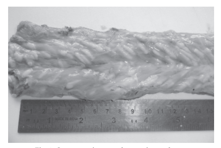
Fig. 3. Sarcocysts in serosal area of oesophagus