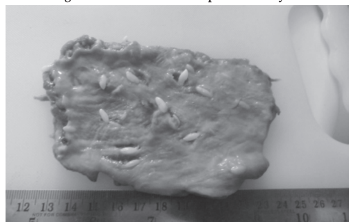
Fig. 2. Sarcocysts in mucosal area of oesophagus